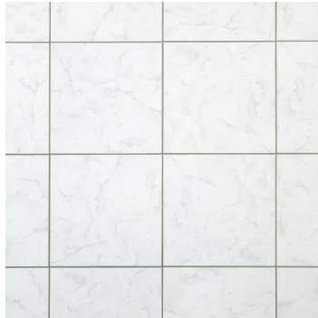
Tile $4/sq ft