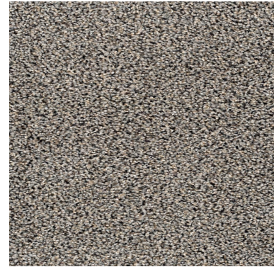
Carpet $3/sq ft