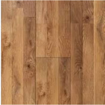
Hardwood $5/sq ft

Decide what type of flooring you will use in your house. What is the total cost for flooring for your whole house? Show your work on the next slide.